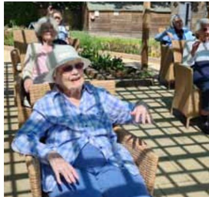
Wilhelmina House residents had a wonderful afternoon of 'Elderdance' in the garden filled with sunshine.