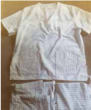
Residents at Whitgift House are doing their bit to help our local healthcare workers by sewing scrubs – by hand!